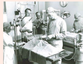
Operations at Angell, 1958.