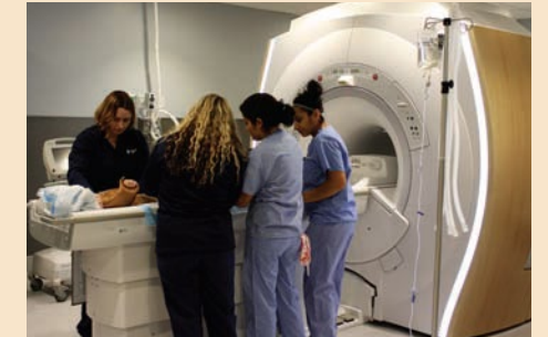
Technicians prep a canine patient for an MRI, 2014.