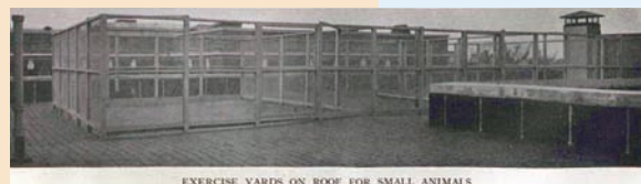
The small animal exercise yards were located on the roof at 180 Longwood Ave., 1915.