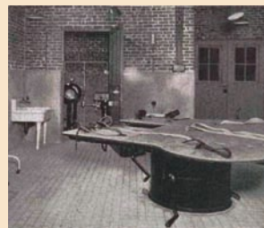
Angell's Horse Operating Room, 1915.