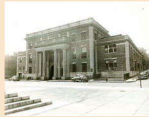
Angell's original building at 180 Longwood Ave. from 1915-1976.