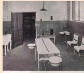
Angell's Small Animal Operating Room, 1915.