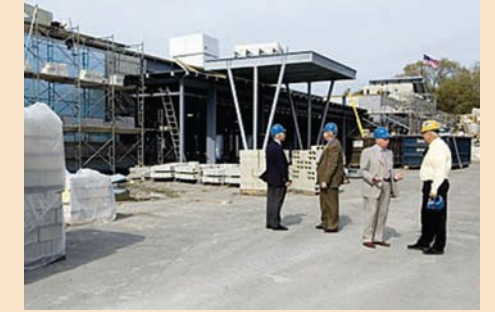
Construction in progress on the new hospital addition at 350 South Huntington Ave., 2005.