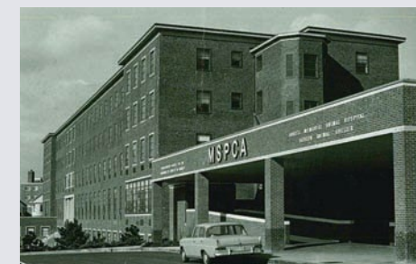
Angell's new building at 350 South Huntington Ave., circa 1976.