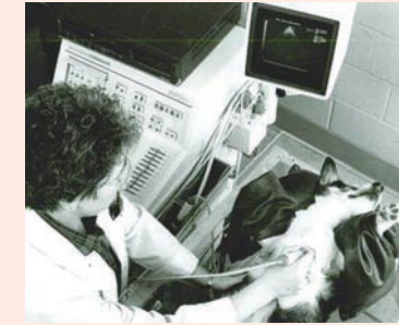
An ultrasound is performed on a canine patient, 1988.