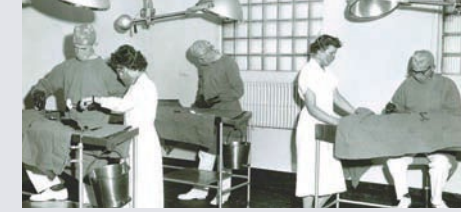
The new operating suite has areas for preparation of the patient, for the surgery, and for the patient's observation and care during recovery from anesthesia, circa 1964.