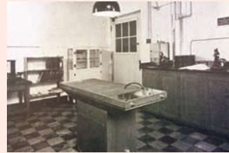
1940 – Angell's diagnostic laboratory for physical, chemical, and bacteriological tests. Back then, histopathological studies of biopsy material were made by pathologists connected with the neighboring Harvard Medical School; now, we have two full-time, board-certified pathologists on staff.