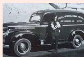
One of Angell's ambulances, 1947.