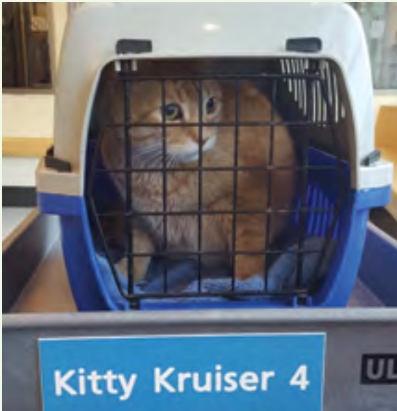
Buttercup in her Kitty Kruiser

Ongoing Plans for Optimizing Patient Care