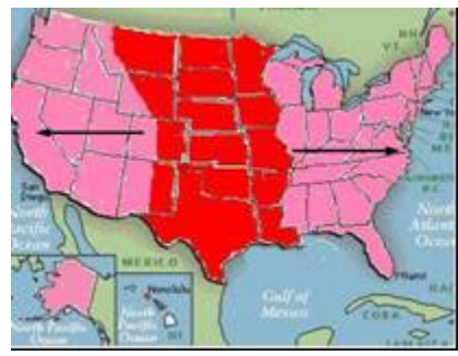
Coyote dispersal range

Coyotes are originally native to Colorado and several other western states. Due to their intelligence, adaptability, and the decline of larger animals, coyotes have successfully expanded their range. They are now found in all states except Hawaii and have successfully established themselves in every urban ecosystem across North America.