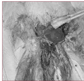
The cloacal prolapse in Chi-Chi.

A fecal Gram's stain revealed an increased number of spore-forming bacteria (likely secondary infection from the chronic prolapse). It was noted that previous diagnostics (blood work and radiographs) had been unremarkable. Based on the history, it was suspected that the prolapse was related to behavioral issues including the chronic masturbatory behavior (which is a fairly common condition in male Umbrella Cockatoos). It was determined that the best chance for resolving the chronic prolapse would be to castrate Chi-Chi, as well as perform a cloacopexy or ventplasty procedure. Castration is an extremely difficult procedure in birds as the testes are internal and closely adhered to the vena cava. Chi-Chi did well under anesthesia and the surgery was successful.