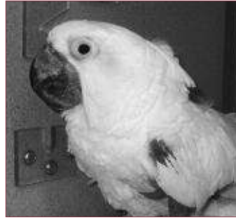
Chi-Chi immediately after castration.

Chi-Chi was presented to the Avian and Exotics service at Angell Animal Medical Center for a chronic cloacal prolapse that had been unresponsive to treatment (reduction followed by placement of transverse sutures). He had a history of chronic masturbatory behavior.