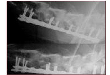
Lateral immediately post-operative (top) and seven weeks post-operative (bottom) cervical radiographs showing interbody bone cement plugs and locking bone plates in place.