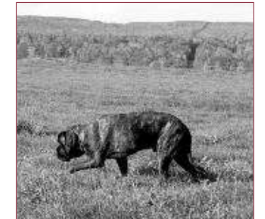
Jack at home, eight months post-operative.

Jack recovered extremely well from surgery, with steady improvement in his ability to ambulate each day after surgery. Within 72 hours he was able to walk, using his front limbs normally. One week post-operatively, he could walk using all four legs without assistance. Ten days post-operatively, he had recovered enough strength to go home, walking unassisted but with significant pelvic limb ataxia. Jack returned to Angell for a follow-up examination and cervical radiographs seven weeks post-operatively. On examination he was able to stand and walk unassisted with a normal thoracic limb gait and only very mild pelvic limb ataxia, occasionally scuffing the left pelvic limb nails and crossing over the pelvic limbs slightly on turns. Cervical radiographs taken at that time found all the implants remained well in place. The owners reported that by two-and-a-half months post-surgery, Jack's gait was normal and he was very active, running and going up and down stairs without restrictions. It has now been nine months since surgery and he continues to do well.