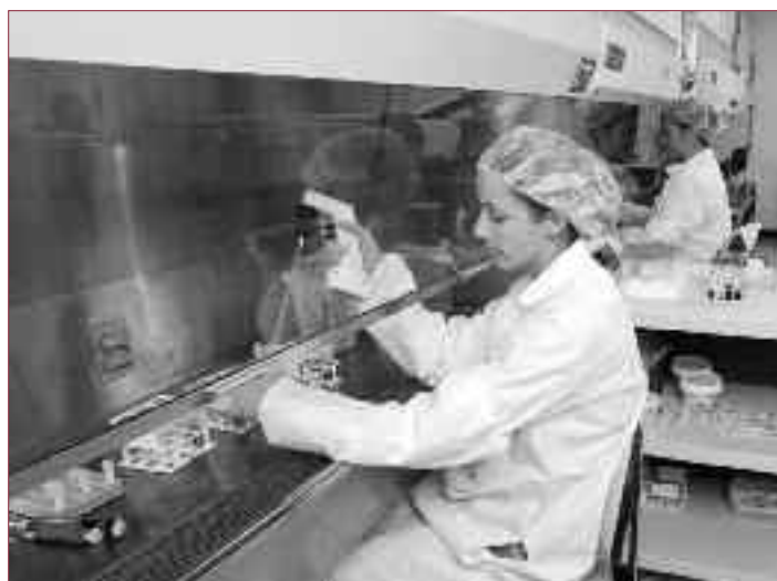
Tissue samples are sent to Vet-Stem, Inc. where the stem cells are isolated.

Additional information is available on Vet Stem's website at www.Vet-Stem.com .